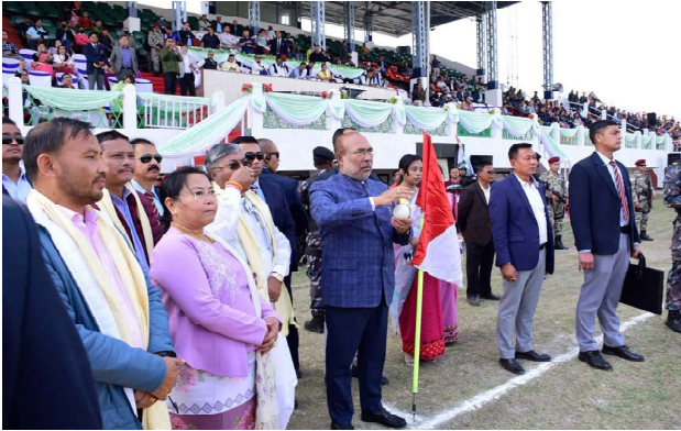
IT News Imphal, Feb 15:

Chief Minister N. Biren Singh inaugurated the 6th Women's International Polo Tournament today at the Mapal Kangeibung, Imphal. The tournament which is organized by Manipur Tourism in association with All Manipur Polo Association (AMPA) will be participated by 5 teams namely South Africa, Luxembourg, India (IPA), India (Manipur-A) and India (Manipur-B).