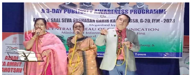
IT News Imphal, Feb 15:

The closing event of 3 days publicity awareness program on Azadi Ka Amrit Mahotsav, Saal Seva Sushasan and Garib Kalyan, Ek Bharat Shreshtha Bharat, G-20 and International Year of