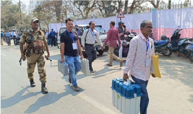
Agency Agartala, Feb 15:

The Election Commission has made elaborate arrangements for Assembly polls in Tripura tomorrow. Polling personnel along with material have started their journey to the polling booths. There are a total of 3 thousand 328 poll-